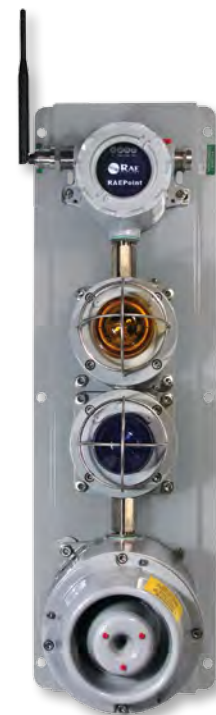
RAEPoint Wireless Alarm Bar