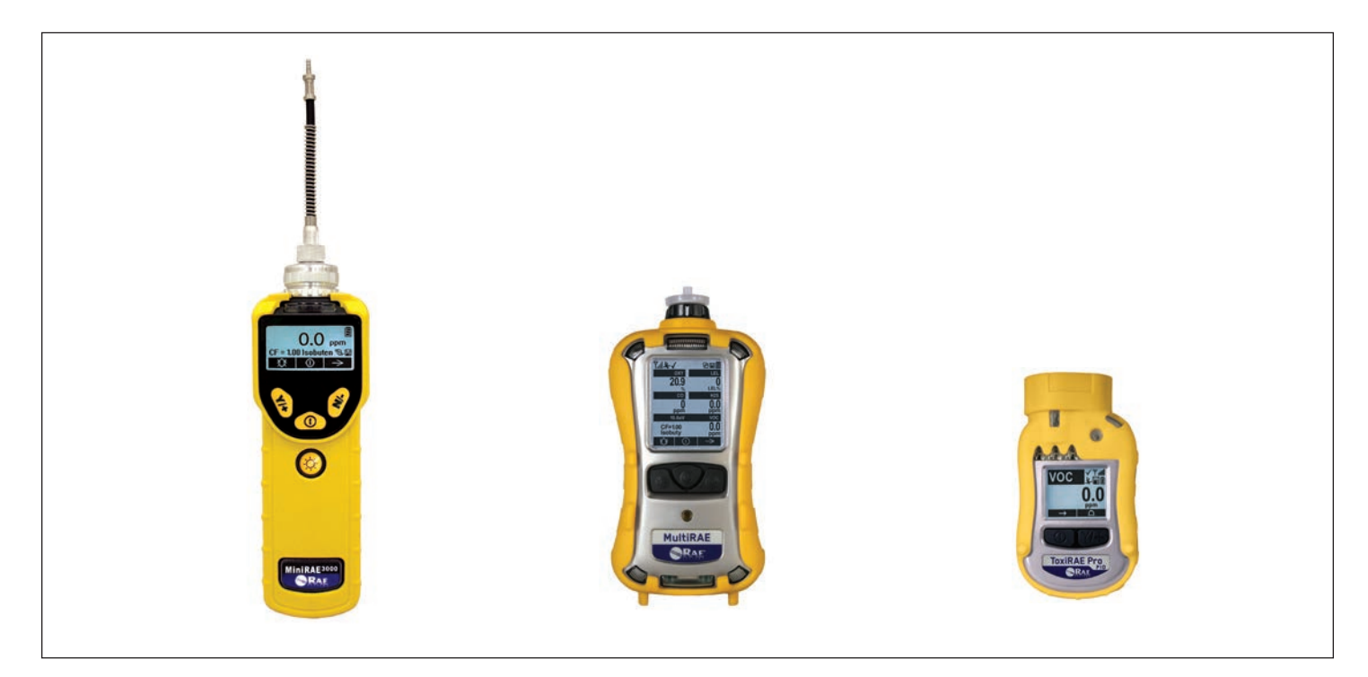
MiniRAE 3000, MultiRAE, and ToxiRAE Pro PID: Three RAE Systems instruments with PIDs.

The creation of a TWA value by AIHA for PGMEA is a new standard. RAE products are ready with pre-programmed correction factors, documentation, and technical staff to support your monitoring needs.