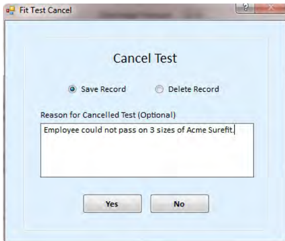
Cancelled tests can be recorded to track employees who could not pass.