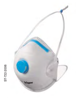
Dräger X-plore® 1300