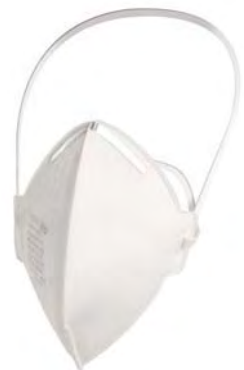
Dräger X-plore® 1750 N95

The specially developed CoolSAFE™ filter material combines various high-performance filter media to achieve an excellent filter performance. Coarse and fine particles are effectively stopped in the various filter layers. At the same time, the breathing resistance remains very low, allowing the user to work easily and without tiring for longer periods.