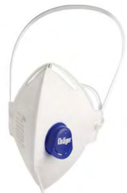
Dräger X-plore® 1700