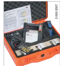
CDS/HazMat Kit with Quantimeter