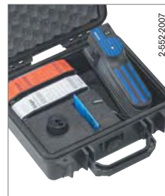
accuro® Hard Side Kit