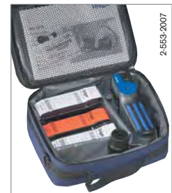
accuro® Soft Side Kit