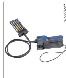
Simultaneous Test Set