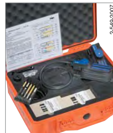
Civil Defense Simultest (CDS) Kit