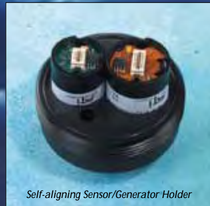
Self-aligning Sensor/Generator Holder