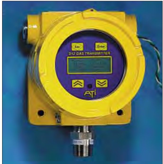
D12 with Combustible Gas Sensor

When RS-485 communication is desirable, D12 transmitters with alarm relays can be supplied with a Modbus(tm) interface. Software supports up to 247 unique addresses for large system use.