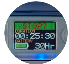
Color coded display showing remaining battery life