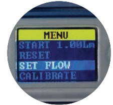
Easy to use menu