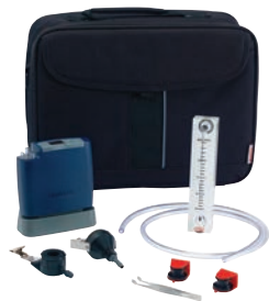
Starter Kit available to include sampling accessories