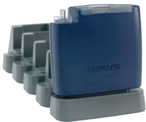
Apex2 pump with 5 way charger