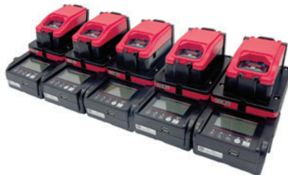
Multiple modules connected to a PC (10 max)

The SDM-04 can also be connected to a PC for automated calibration, bump testing, and archiving of datalog data from 04 Series instruments. Up to ten SDM-04 docking stations can be connected simultaneously using USB cables and the SDM-04 includes connections for one to three calibration gas cylinders.