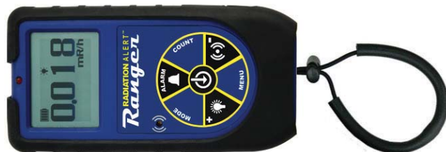
Shown with ruggedized protective boot