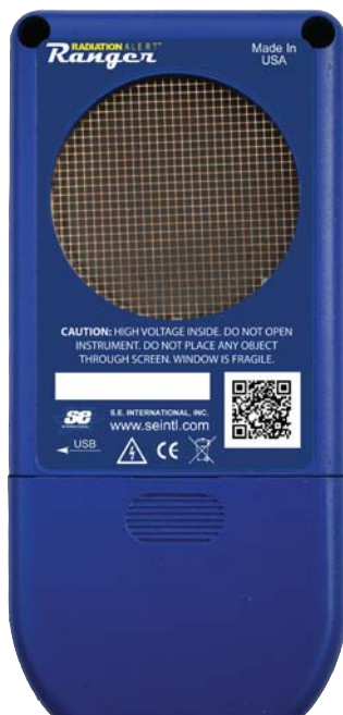
Detector Window and AA Battery Door on Back