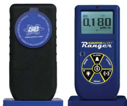
Lanyard, Ruggedized Boot, Detector Cover, USB Cable and Stand Included