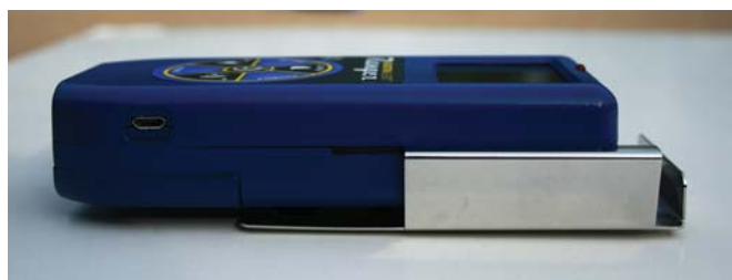
Optional Wipe Test Plate Shown