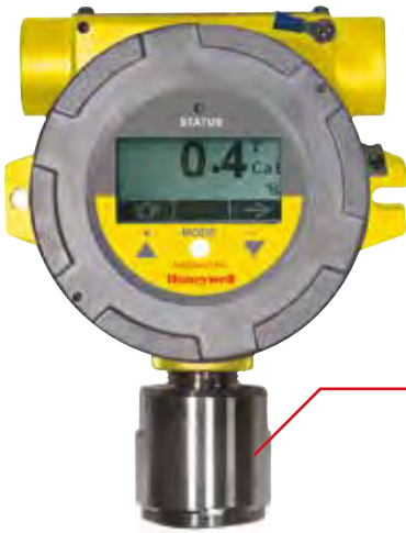
RAEGuard 2 Fixed Sensor Head