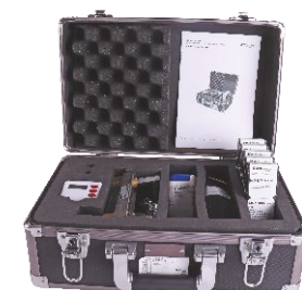
Air Tester MP Kit For plant supplied air & medium pressures