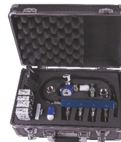
Air Tester HP Multi Port Kit For high pressure compressors & compressed air cylinders

These kits provide a convenient means to test the purity of compressed breathing air from compressors, plant supplied air systems or high pressure air cylinders for self-contained breathing apparatus. It is often used by firefighters. Checking the levels of carbon dioxide, carbon monoxide, oil and water vapor, high pressure kits include adapters for 200 / 300 bar or in U.S.A. for 2216 / 4500 psi SCBA.