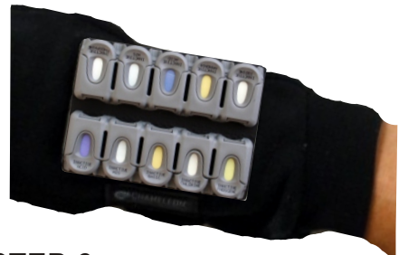
Check your armband for color change every few minutes during mission.