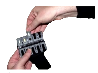
STEP 4: Insert each cassette with text facing up into Chameleon armband.