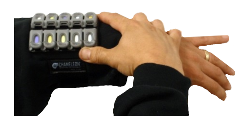
STEP 5: Slide armband over wrist with cassettes facing up. Adjust to fit securely.